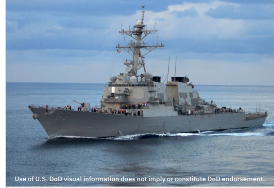
Use of U.S. DoD visual information does not imply or constitute DoD endorsement.

The software interface is functionally similar to the AN/UYK-43 military computer. I/O chains written for the AN/UYK-43, -7, -44 or -20 can be easily ported to execute on the Antares NTDS board, providing a path to transition legacy systems to modern, open systems. Antares NTDS boards execute sequences of instructions directly from VMEbus memory. The on-board program counters (total of five) are used to access memory, read an instruction and execute it. The command program counter is "loaded" by the CPU via a single 32-bit "store" to the VMENIO board. At that point, the Antares NTDS 4002 board begins to execute its instructions directly from memory, without any further CPU intervention. The I/O chains will normally have been generated at compile time within the user program with common data structures, records or arrays. The address supplied to the board command program counter is a pointer to the start of the I/O chain to be executed. All I/O operations are controllable from a high-level language.