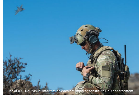
Use of U.S. DoD visual information does not imply or constitute DoD endorsement.