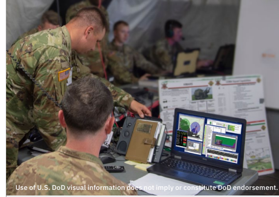
Use of U.S. DoD visual information does not imply or constitute DoD endorsement.