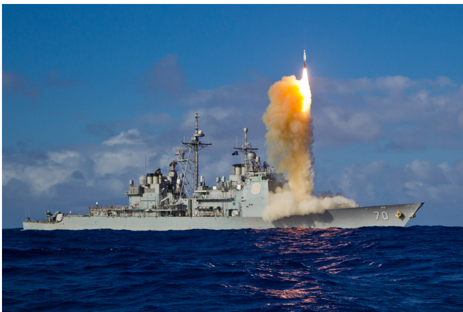
The appearance of U.S. Department of Defense visual information does not imply or constitute DOD endorsement.

Our team is committed to serving the needs of the Navy's warfighters and to powering our nation's defense.